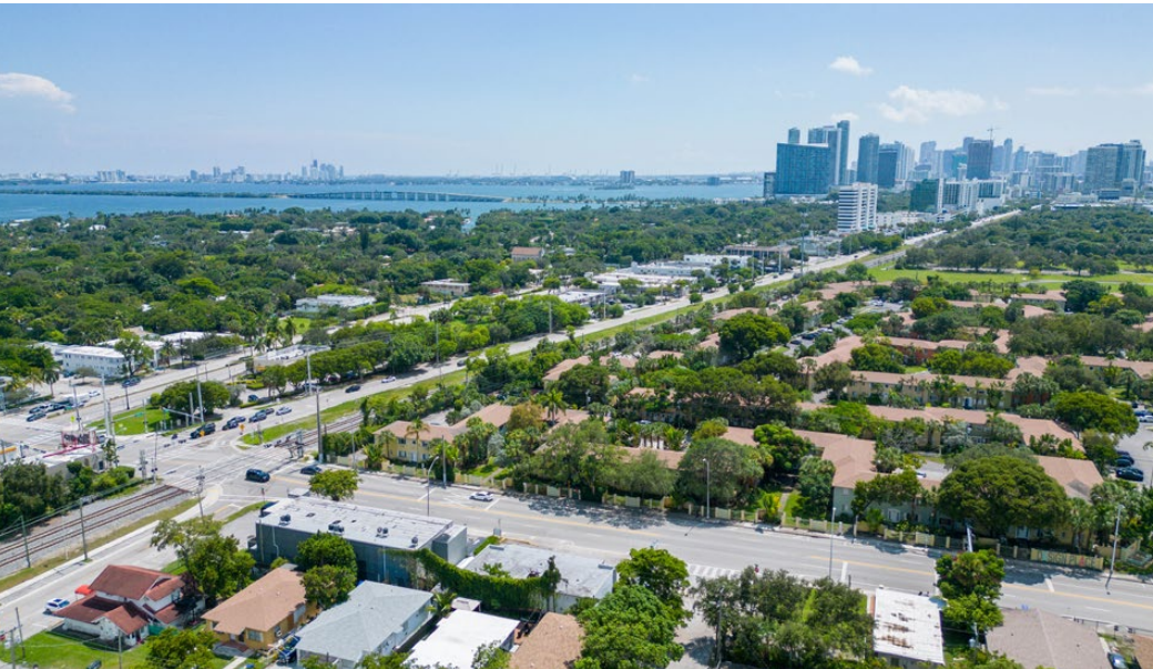
375 \text{ NE } 54^{\text{TH}} \text{ STREET - MIAMI, FL } 33137