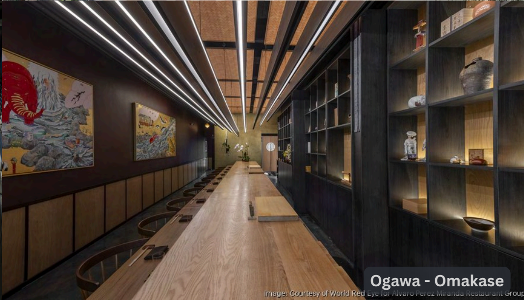
Ogawa - Omakase

Image: Courtesy of World Red Eye for Alvaro Perez Miranda Restaurant Group