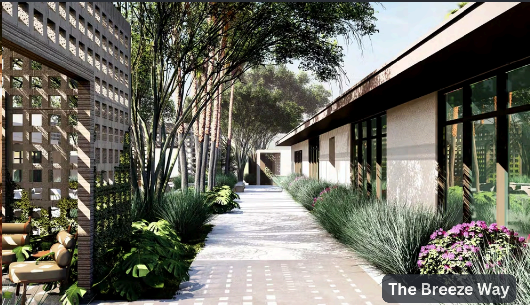
The Breeze Way